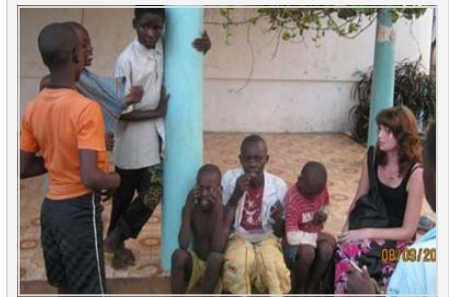
The children of Wana Wa Mola study the 50 Principles, Practices and Precepts of Jesus with a member of the Wana Wa Mola staff.