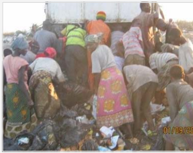
Many of the children who live on the street scavenge the city's dumping site (Mwakirunge).

Wana Wa Mola , which means "children of God" is a witness of God's love to some of the most vulnerable of God's children. The mission has two components, The Survivors Den which is an outreach to the boys who still live in the streets because there isn't enough room in shelters. This program has a monthly budget of $200. The House of Jesus is a residential program whereby the boys study the "50 Principles, Practices and Precepts of Jesus," a Cornerstone group study. There are currently thirteen boys living in the home, two house fathers and a house mother. The home has a capacity for seventeen youth. Nine of the children are enrolled in the public school with annual fees running $500 per child (tuition, uniforms, books). Wana Wa Mola's annual budget is approximately $30,000 per year.