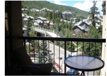
Beaver Creek Village, CO