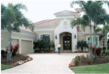
Lakewood Ranch, FL