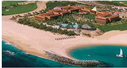
Los Cabos, Mexico