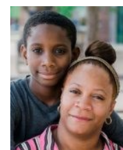
Kenya & son

Interested in volunteering? There is a sign-up sheet across from the reception desk or you may call (309-685-5258) or email (info@ffcpeoria.com) and you will be put in touch with Mike. All of Mike's updates are also posted on the 1stNews.