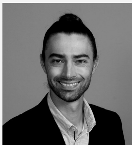
Zachary "Zach" Lysdahl, Minister of Youth & Families