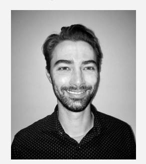
Zachary "Zach" Lysdahl, Minister of Youth & Families