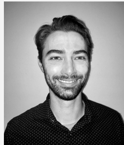
Zachary "Zach" Lysdahl, Minister of Youth & Families