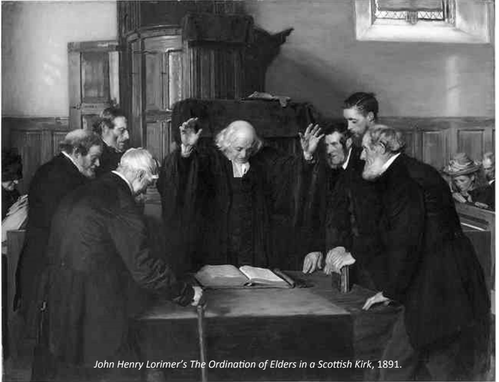
John Henry Lorimer's The Ordination of Elders in a Scottish Kirk, 1891.

10:00 am Worship Service January 6th, 2019