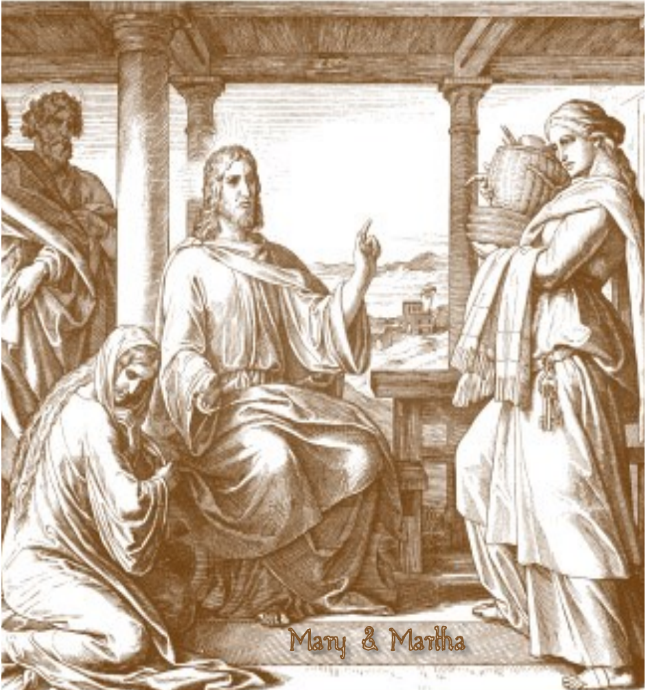
Mary & Martha

10:00 am Worship Sunday, July 21st, 2019